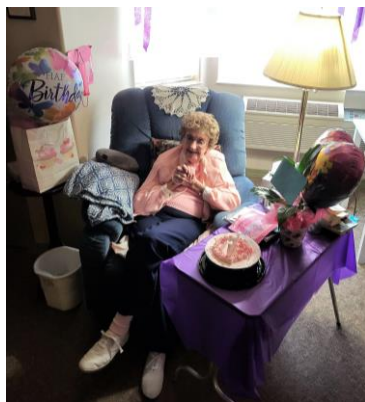
This dear lady, also in Weiser, turned 101 this month