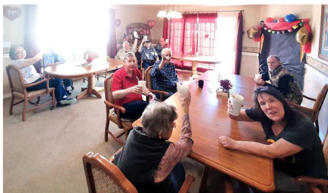
Middleton residents enjoying root beer floats during their Olympic Ceremony