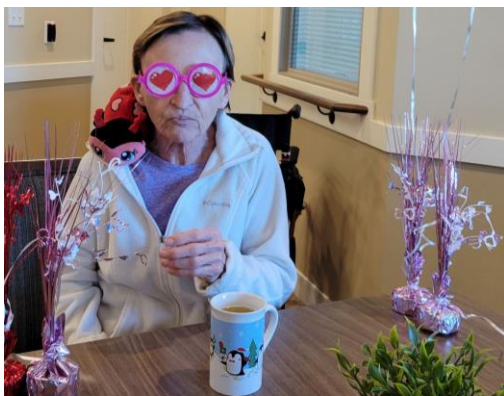
This Lochsa Falls resident really enjoyed celebrating Valentine's Day