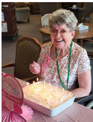
This sweet lady, in Weiser, turned 84 this month