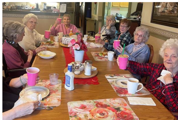
Mt Home residents enjoying a meal, root beer floats and a laugh or two