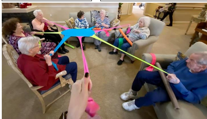
Meridian residents doing some stretching exercises