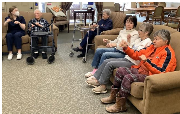
Payette residents doing chair exercises