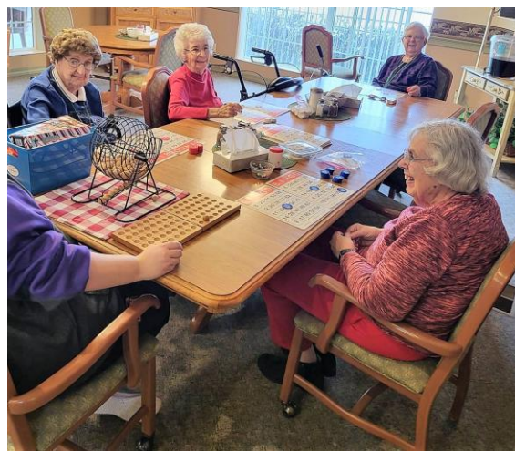
Bingo in Weiser – just a little friendly competition