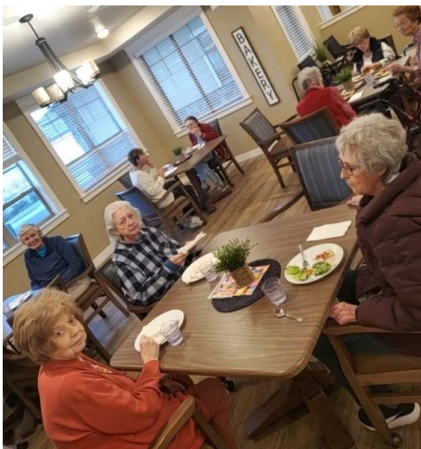
A pizza party at Lochsa Falls, loved by all