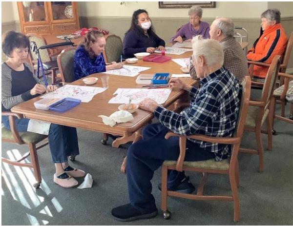
Payette residents practicing their art skills