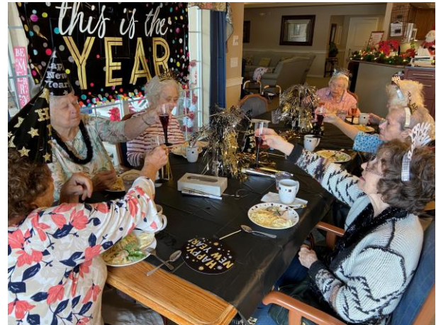
The residents of Emmett and Meridian wish you all a Happy New Year!