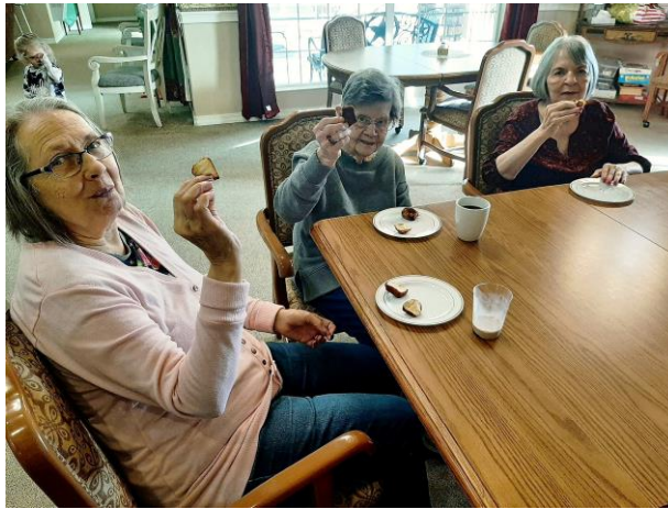
These Middleton ladies sampling their cooking and sharing quality time together