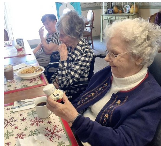
A little bit of hot cocoa and a snowman treat in Mt Home