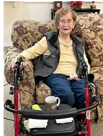
Enjoying coffee and a little TV in Boise