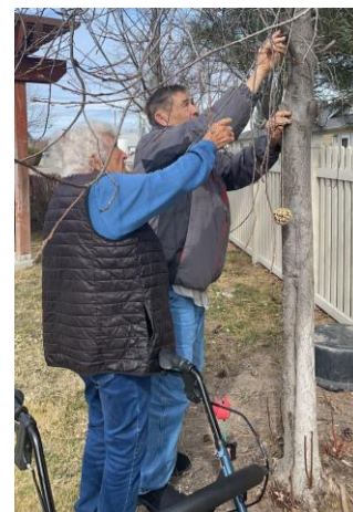
Emmett residents made pinecone bird feeders and took advantage of the sunny day to hang them outside