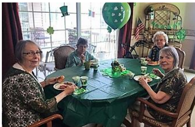
Middleton residents enjoying everything green on St. Patrick's Day