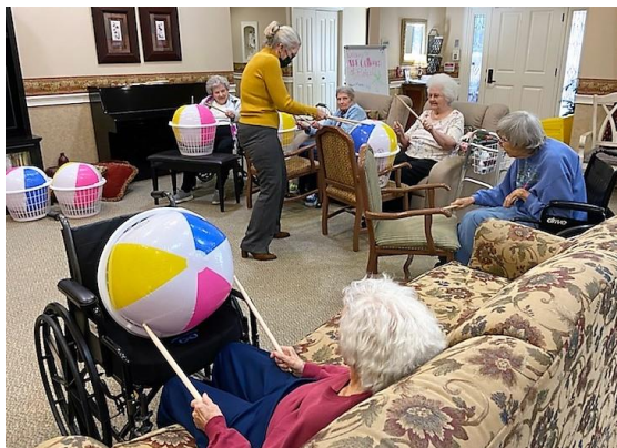
Weiser and Boise residents also join in the drumming