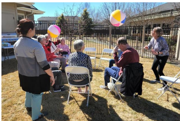
The residents at Lochsa Falls enjoy the sun and a little exercise