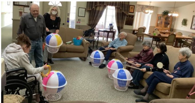
Payette and Meridian residents enjoy making a joyful noise with their beach balls and drumsticks