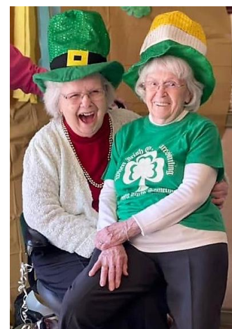
These Mt Home ladies enjoy their St. Patrick's Day celebration! Love these happy faces!