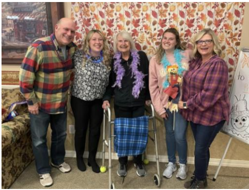
The Cottages of Boise's Harvest Party brought out Families and Friends