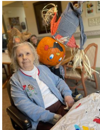
A little bit of silliness in Mt Home