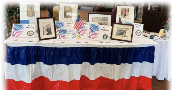
Veteran's Day Celebration at The Cottages at Lochsa Falls