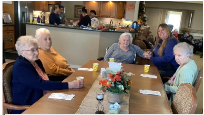
Fly swatter, balloon toss at Lochsa Falls