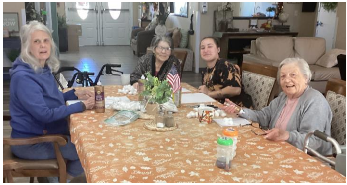
Residents at Columbia Village enjoy crafts and conversation