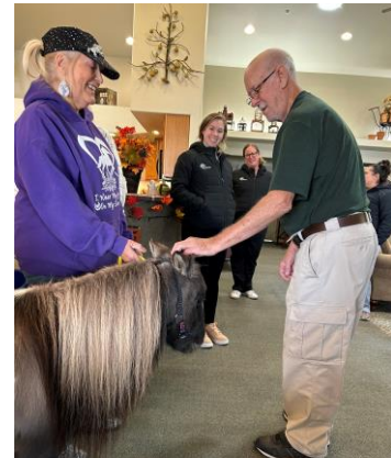
White Oak Hospice brought the miniature ponies to Emmett