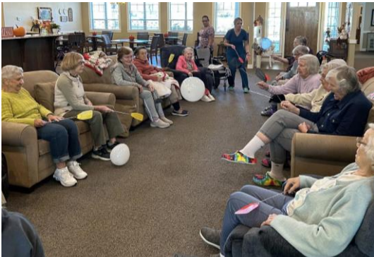
Fly swatter, balloon toss at Lochsa Falls