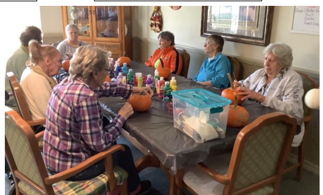
Payette residents enjoy a fun Fall craft